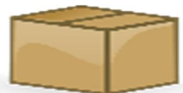
Multiple Plaster/STS Casts