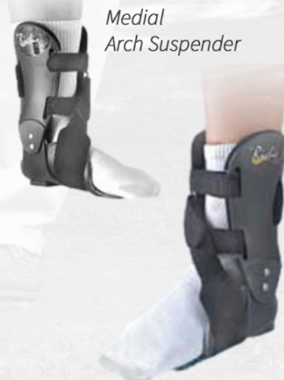
Medial Arch Suspender